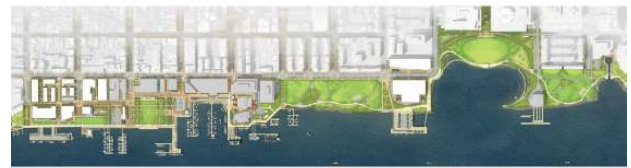
ALEXANDRIA WATERFRONT COMMON ELEMENTS DESIGN GUIDELINES SEPTEMBER 7, 2016

Materials, treatments, fabrication requirements and color requirements can be found in the Alexandria Waterfront Common Elements Design Guidelines.