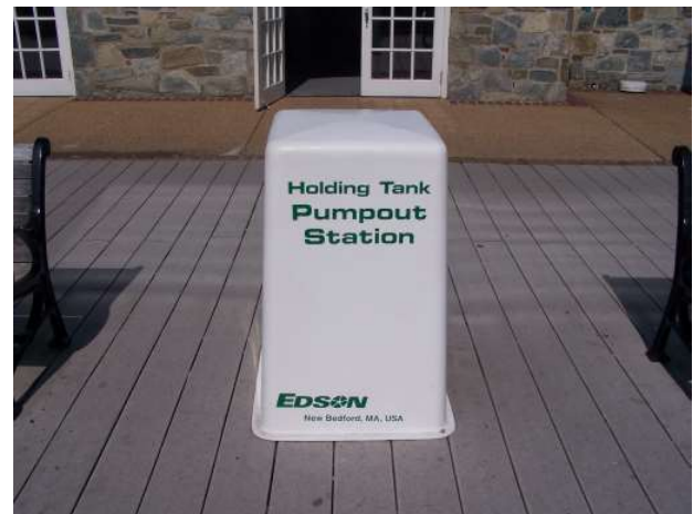
Pump out station

Pump out stations are anticipated to require replacement after 10 years based on normal and ordinary use.