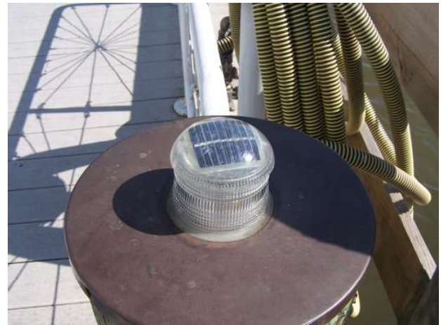
Marina solar light

Bulbs and fixtures are anticipated to require replacement after 7 years based on normal and ordinary use.