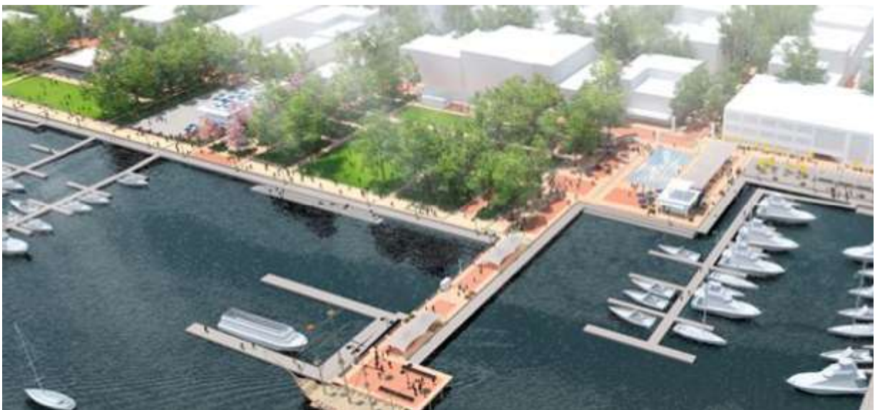
Marina & Waterfront Concept by Olin